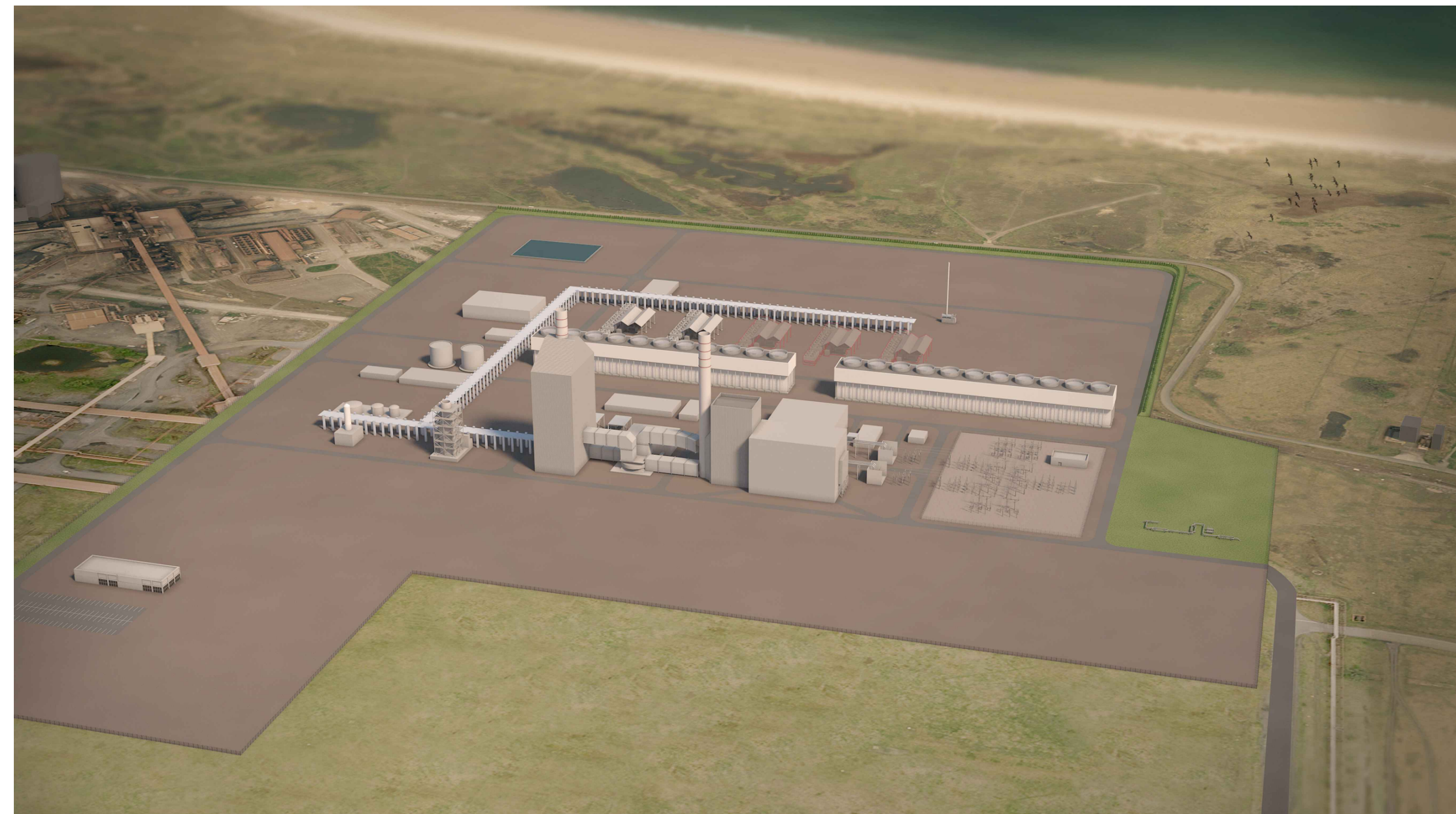
3D AERIAL VIEW N.T.S.