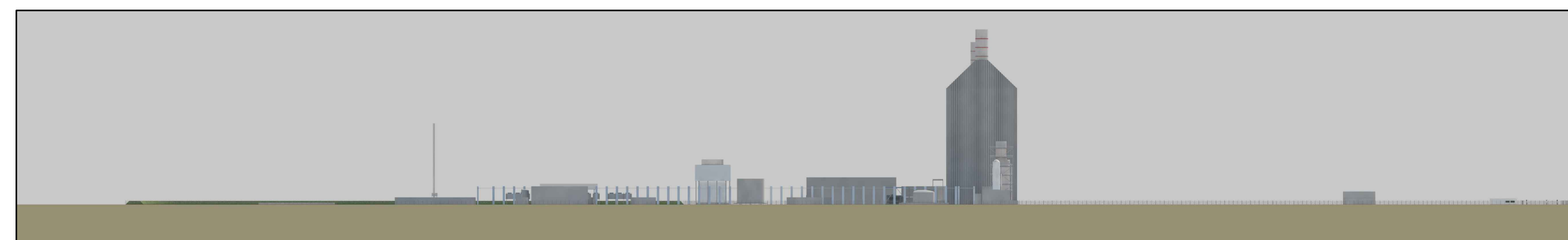
ELEVATION LOOKING EAST Scale 1:2500