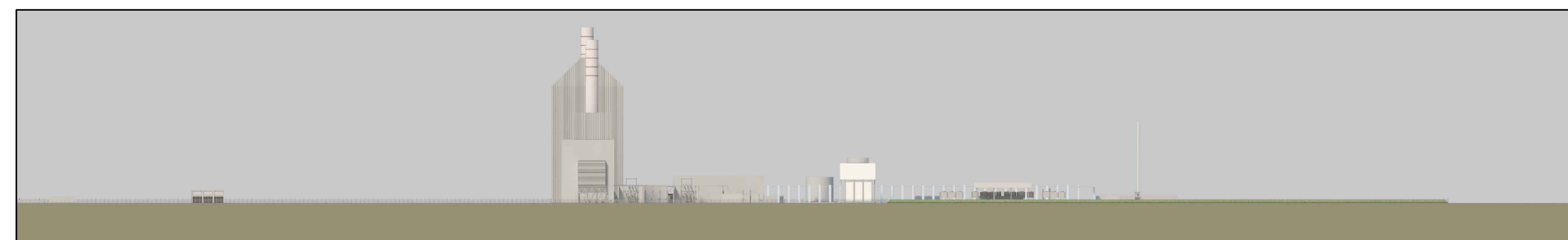
ELEVATION LOOKING WEST Scale 1:2500